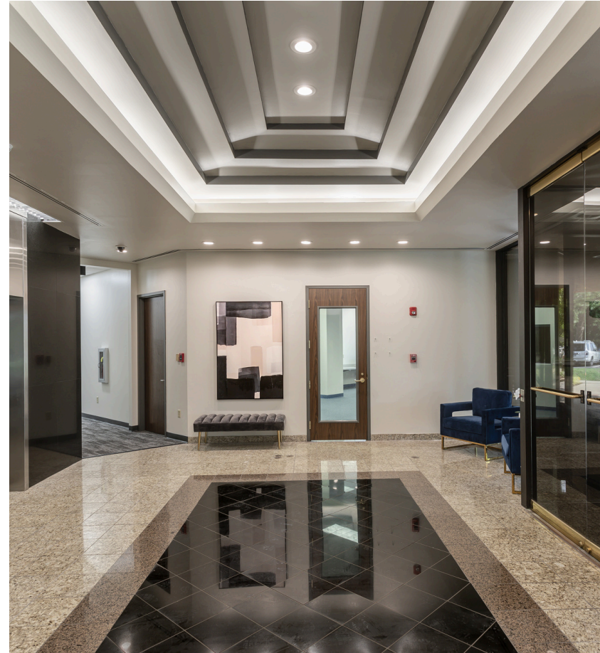
Suite 200 | 3,828 RSF